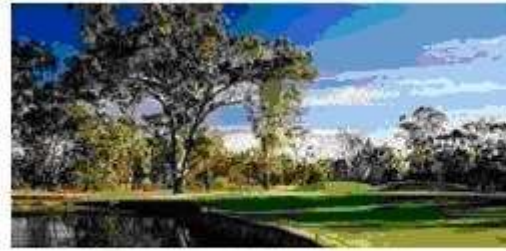
SUNDAY LEAVE PASS 2011