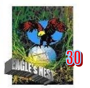
SUNDAY LEAVE PASS 2012