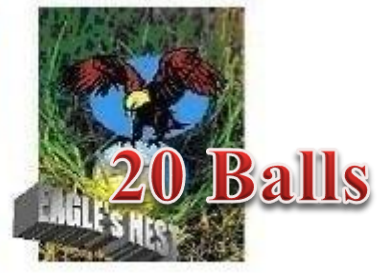
SUNDAY LEAVE PASS 2018

Congratulations to Big Mick for 100 SLP Rounds.