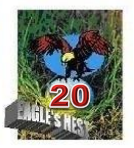
SUNDAY LEAVE PASS 2018