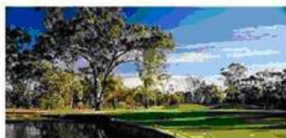
SUNDAY LEAVE PASS 2008