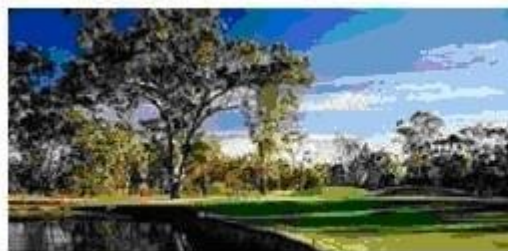
SUNDAY LEAVE PASS 2011