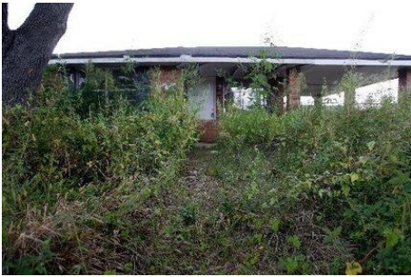
Newell's front lawn

Practice makes perfect. Highway was so committed to a posting a good performance at Centenary Park that he invested all of his time into making his dream a reality. The stay at home dad, never stayed at home, while he has been out grooving his golf swing his front lawns have been neglected and the grass is 3 foot high, (he has no back lawn as it is just a cluster of divots) the dishes are piled up in the sink, dust and cobwebs are all over the house, the floors are littered with kids toys and food scraps and the washing and ironing baskets have been left to overflow for the first time in 10 years.