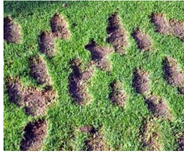
Newell's back lawn