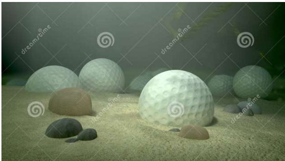
Chris Sfiligoj's six golf balls laying at the bottom of the lake on the 4 th Hole at Devils Bend