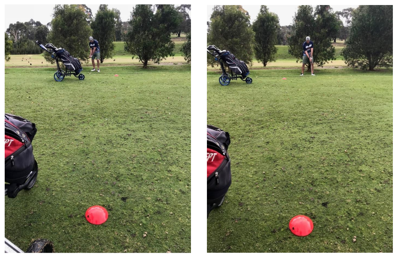
ANSWER: Photo A was Cams 2<sup>nd</sup> shot from just behind red tees. Photo B was Cams 3rd shot from just in front of the red tees.

The Game is called spot the difference. Below are two identical photos with a minor difference see if you can spot it.