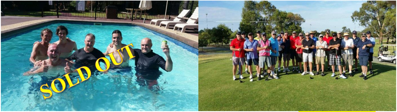
Please Note: The Golf trip at Corowa Golf course has sold out. The date of the golf trip will be Friday 8<sup>th</sup> to Sunday 10<sup>th</sup> DECEMBER 2017. The Cost is $330.00. If you haven't already paid a $30 deposit then please do so this month.

May to Sunday 21<sup>st</sup> of May. There are always enough Dark Clouds looming over a round of golf at Devils Bend however the thought of trying to come home after playing golf and drinking cans with a group of mates on Mother's Day was just a bit too much to ask for all concerned. Golf is booked for 12pm