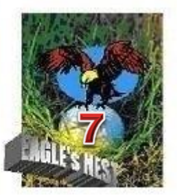
SUNDAY LEAVE PASS 2017