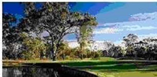
SUNDAY LEAVE PASS 2011