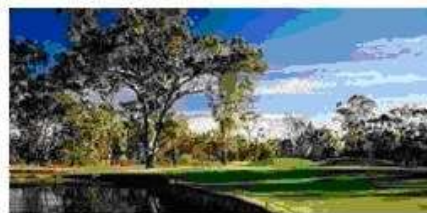
SUNDAY LEAVE PASS 2010