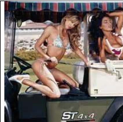
What we thought a golf cart with Undy's on it might Look like.