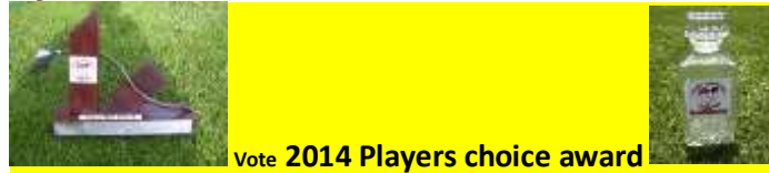
Vote 2014 Players choice award

Don't forget to put some thought into your votes for the player's choice awards. Over the next few days everyone will be receiving an email with a link to the voting nomination form through the SURV's website, all you will then need to do is to fill it in and send it back to us with your nominations.