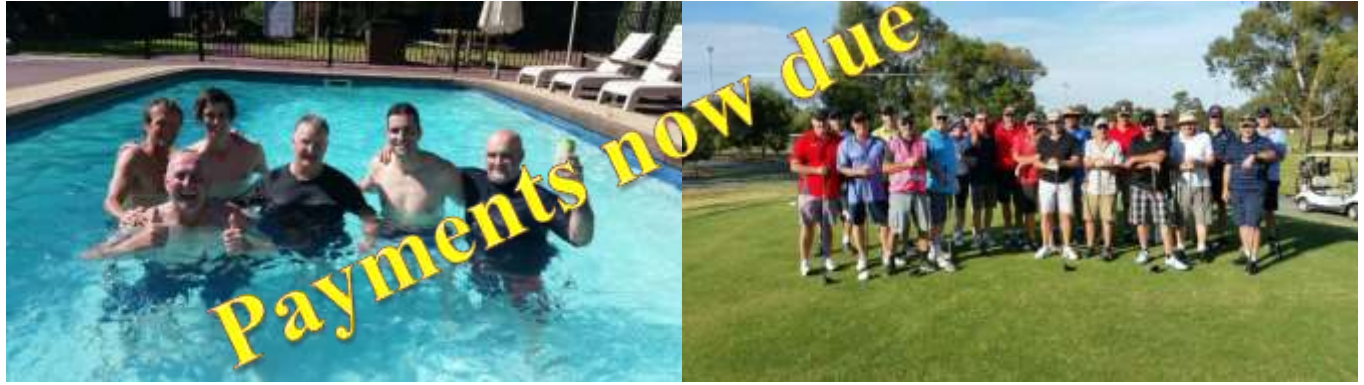
Please Note: We are now taking final payments for the Golf trip at Commercial Golf course in Albury. The date of the golf trip will is Friday 9th to Sunday 11th DECEMBER 2016. The Cost is $330.00. We have booked for 28 players (3 people per room).

Please see list attached to the end of this email to find out how much you have paid and therefore how much is left outstanding.