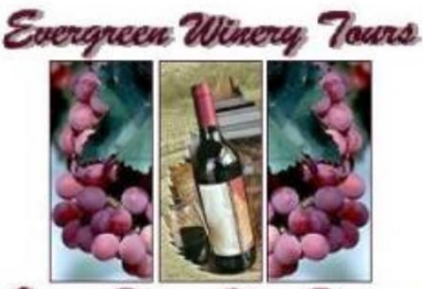
Sponsored by Yama Ranges Wine Regions

For those who were not aware of the "hole in one prize", any player who scores a hole in one or an Albatross during a Sunday Leave Pass event will win a complimentary Chauffer Driven Winery Tour for 2x people through the Yarra Valley, courtesy of Evergreen Winery Tours. So, start aiming at the hole we want to give it away this year there was a few close calls over the years but we are still yet to achieve the perfect shot despite more than 12000 attempts since 2004.