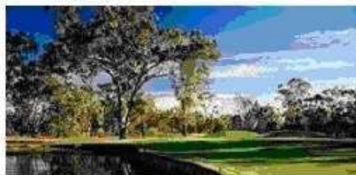
SUNDAY LEAVE PASS 2011