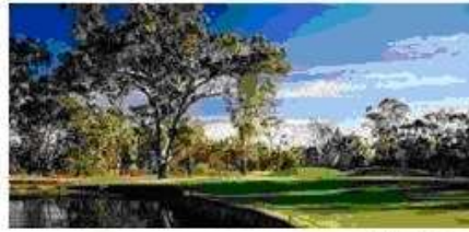
SUNDAY LEAVE PASS 2010