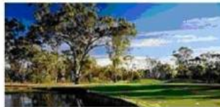
SUNDAY LEAVE PASS 2007