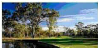
SUNDAY LEAVE PASS 2007