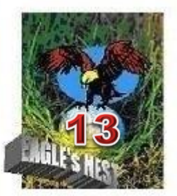
SUNDAY LEAVE PASS 2017