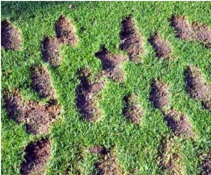
NEWELLS Back Lawn

month and he is therefore becoming a more competitive force especially with the very high handicap that that we are starting to regret ever giving to him.